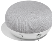
(retail price $80)

you'll both be entered into a draw to win a Google Home Mini!