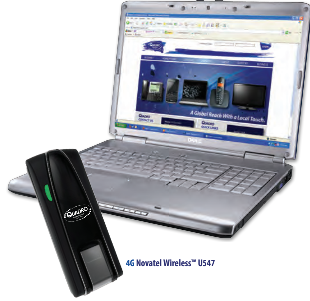
4G Novatel Wireless™ U547