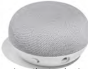
(retail price $80)

you'll both be entered into a draw to win a Google Home Mini!